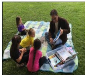
A Youth Development Specialist with the Tribe's Educational Division during a child reading group. The Tribe uses Vroom tips as a way to engage children during these groups.

Oregon Early Learning Division Vroom Case Study Cow Creek Band of Umpqua Tribe of Indians